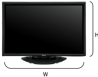
Measuring the display

dimension" listed for each size. The general rule of thumb is to find an overlay that is no more than 3/4" larger than the outside dimension of the display. This insures that the touch overlay does not have a visible gap between the frame and the display and is covered by the width of the frame.